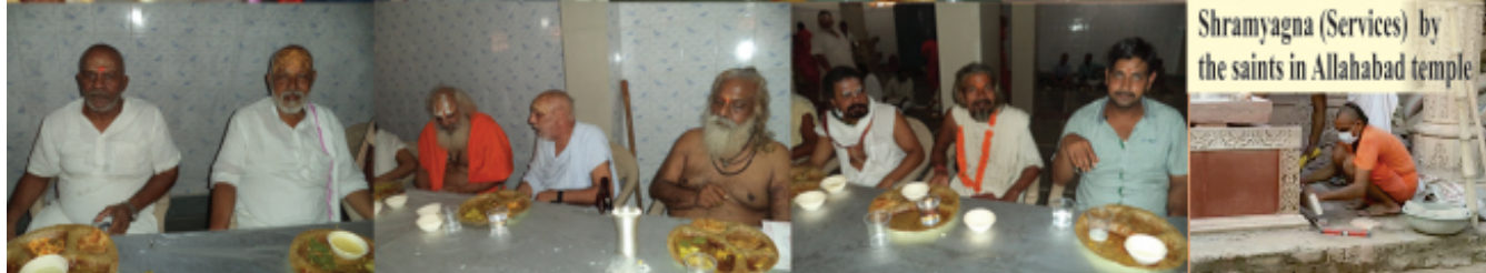
Shramyagna (Services) by the saints in Allahabad temple