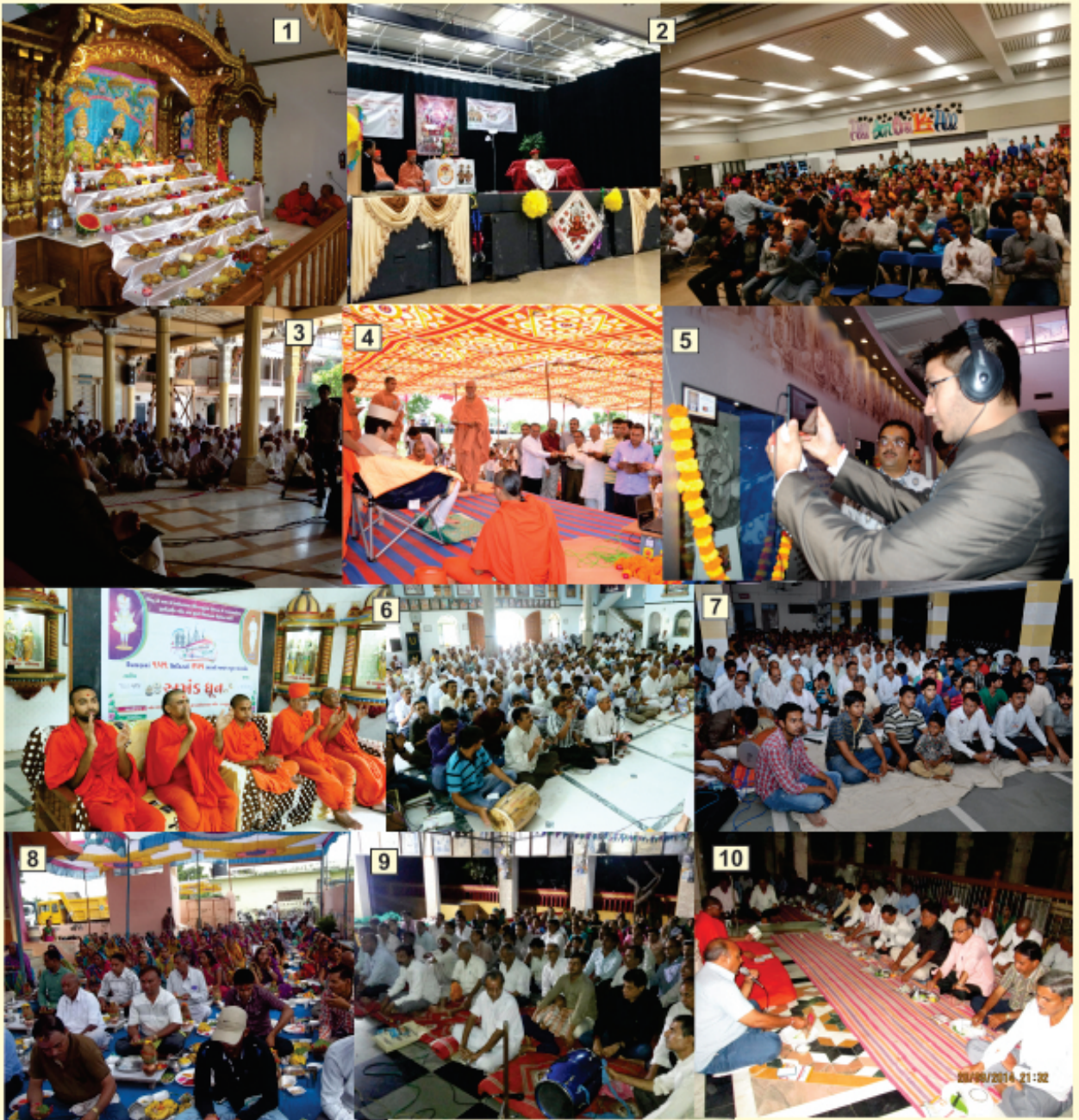
1. Annakut Darshan on the occasion of Patotsav of Detroit (America) temple. 2. H.H. Shri Acharya Maharaj blessing the Sabha of new I.S.S.O. Chapter of Western Canada. 3. H.H. Shri Lalji Maharaj blessing the devotees in Ahmedabad temple on the occasion of Parayan. 4. Haribhaktas performing aarti of H.H. Shri Lalji Maharaj in the Sabha organized in Bapunagar approach temple as a part of Shree Narnarayandev Mahamahotsav. 5. H.H. Shri Lalji Maharaj inaugurating the Audio-visual guide port (tablet) in Shree Swaminarayan Museum. 6. Satsang Sabha organized by the saints in Karmshakti temple as a part of Shree Narnarayandev Mahamahotsav. 7. Satsang Sabha in Naroda as a part of Shree Narnarayandev Mahamahotsav. 8. Group Mahapooja in Madhavghadh temple as a part of Shree Narnarayandev Mahamahotsav. 9. Satsang Sabha in Bhabhar as a part of Shree Narnarayandev Mahamahotsav. 10. Group Janmangal Path in Naranghat temple as a part of Shree Narnarayandev Mahamahotsav.