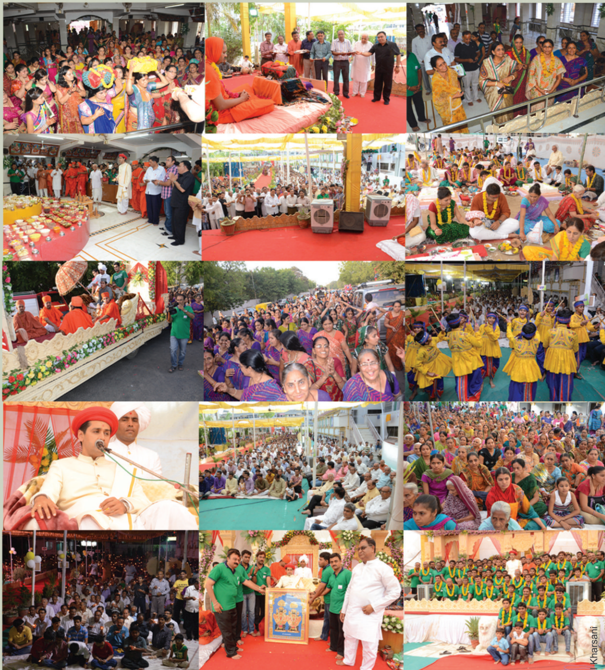
Glimpses of Rajat Jayanti Mahotsav celebrated in Shree Swaminarayan temple, Jivrajpark (Ahmedabad).

Registered under RNI NO.-GUJENG/2007/20198 "Permitted to post at Ahd PSO on 11th every month under postal Regd. No.GUJ.582/12-14 issued SSP Ahd Valid up to 31-12-2014